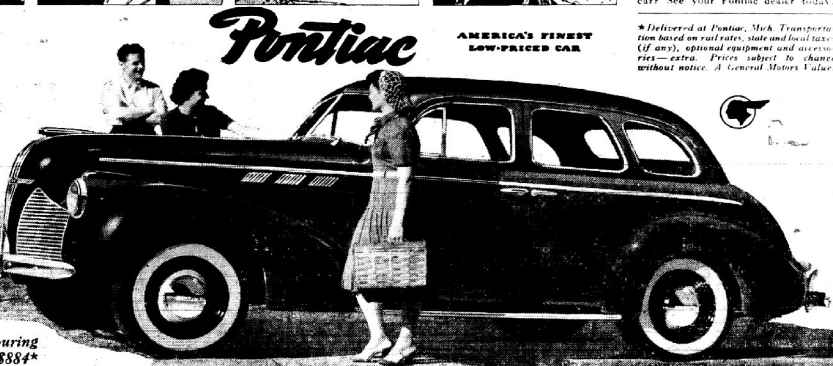
Special Six 4-Door Touring Sedan, as Illustrated $884*